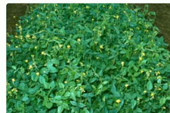
Annual or perennial trailing or climbing herb