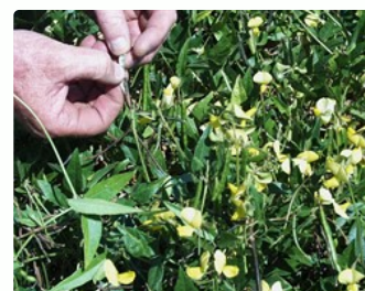
Foliage, flowers and pods