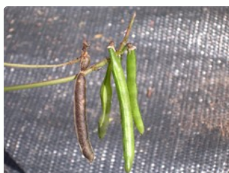
Pods adpressed pubescent with a short curved beak; green when young, ripening to dark brown/black when ripe