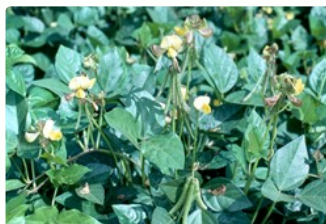
Foliage, flowers and immature pods (APG 17491)