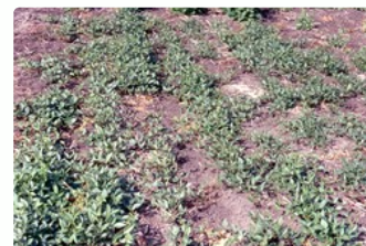
Establishment on clay soils, sub-humid southern Queensland Australia (cv Dalrymple)