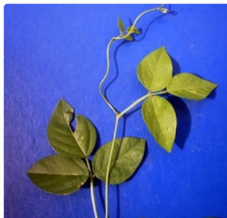
Leaves trifoliolate; twining stem