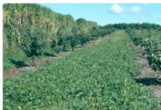
A useful cover crop; cv. Dalrymple used as a groundcover in orchards in northern Australia (cv Dalrymple)