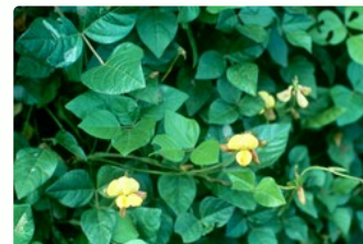
Inflorescence a few to many flowered axillary raceme (cv. Dalrymple)